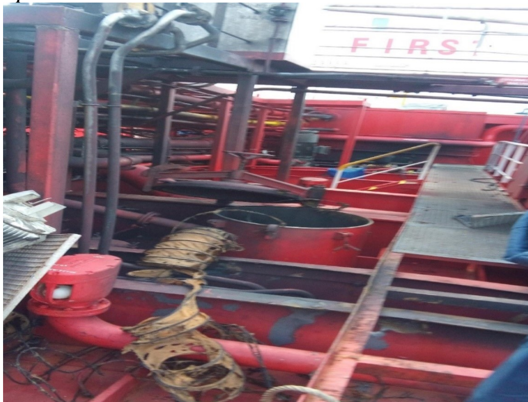
A fixed gas freeing fan and venting line is fitted on deck. The flexible venting tubes are connected to the venting line.