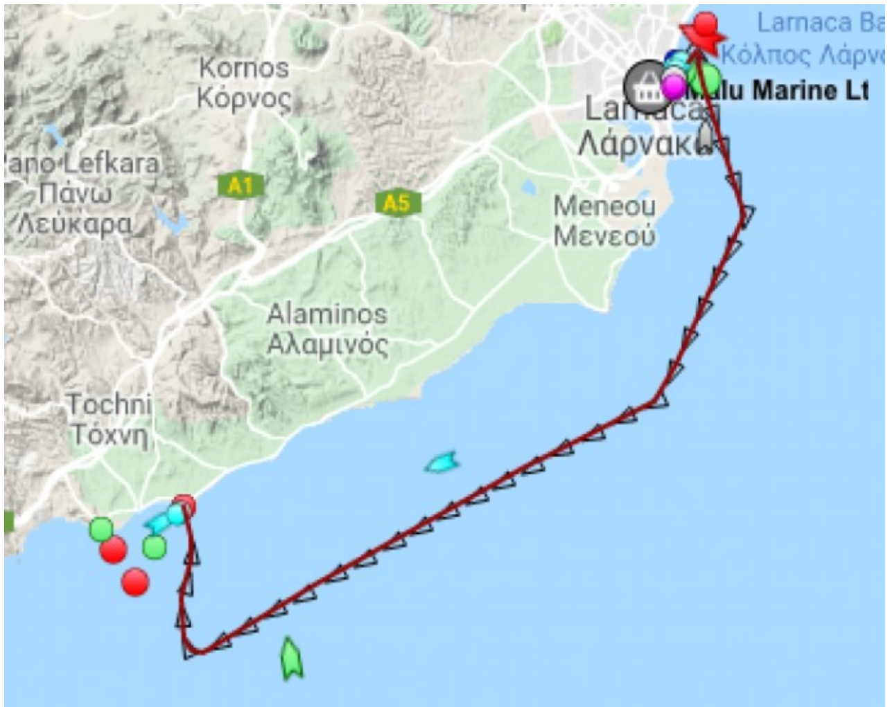
“ATHLOS” track from Larnaca gulf to beaching position

At 07:42 l.t.: Full Away (FA) on passage. Destination Aspropyrgos (Greece).