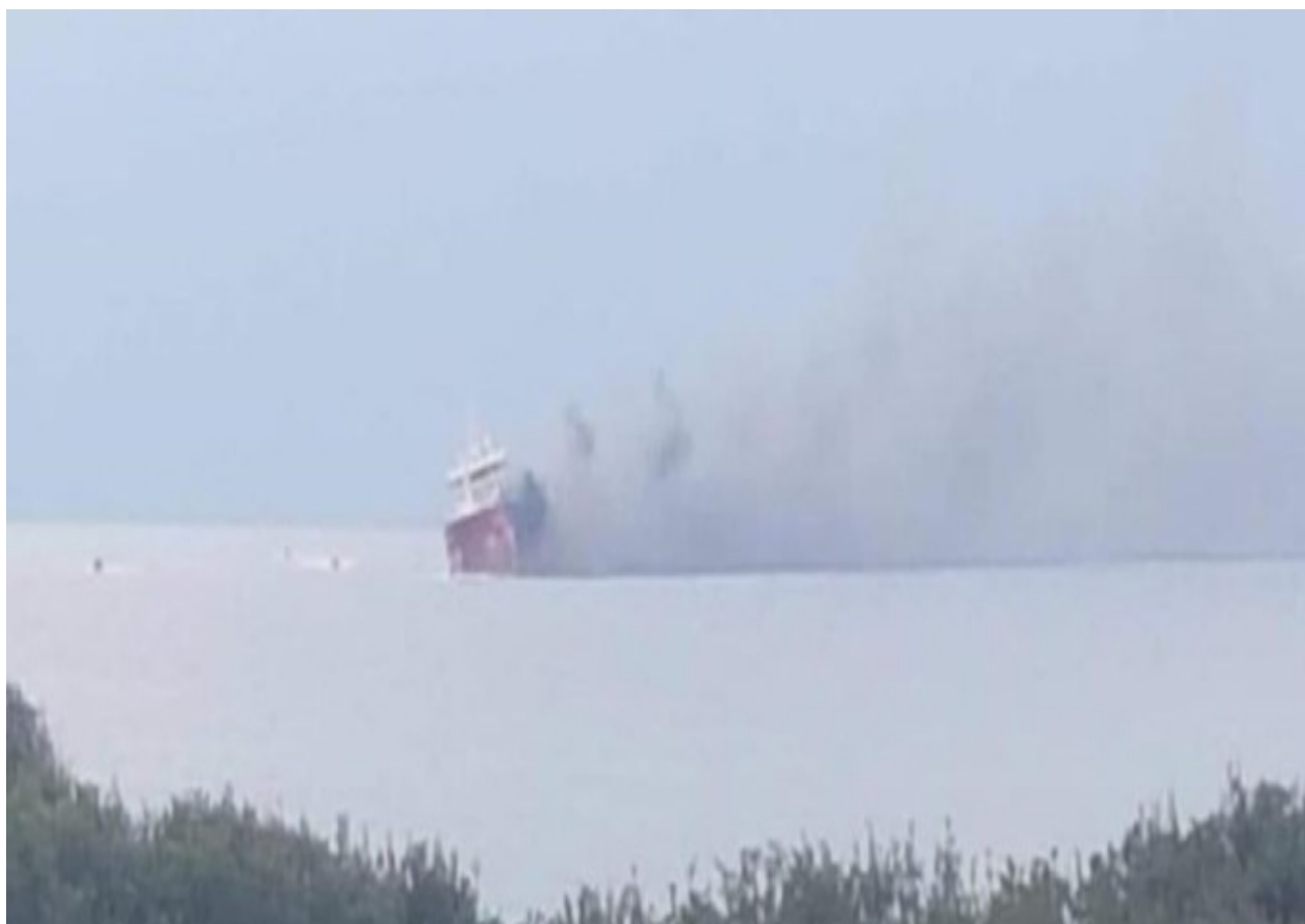
“ATHLOS” proceeding towards the shore for beaching.