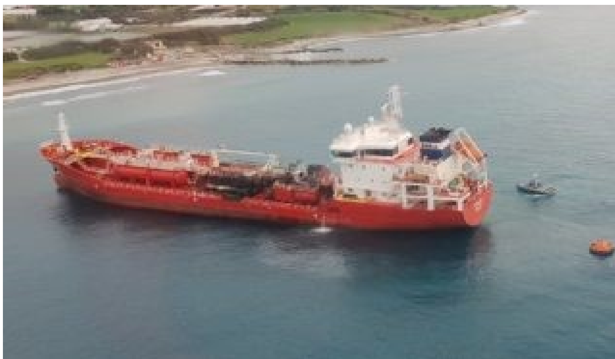
“ATHLOS” stranded 200m from the shore, with 5 degrees list to port.