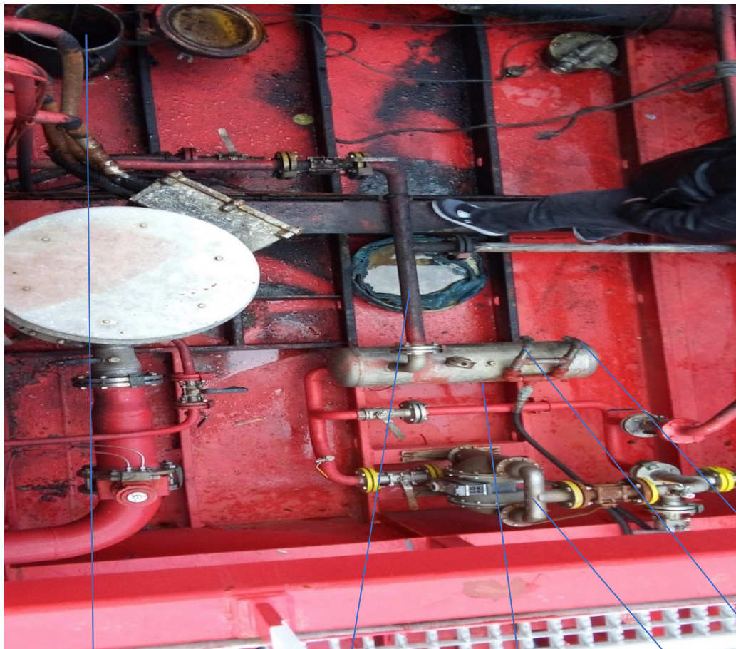
Sounding /Sighting Port Pipes