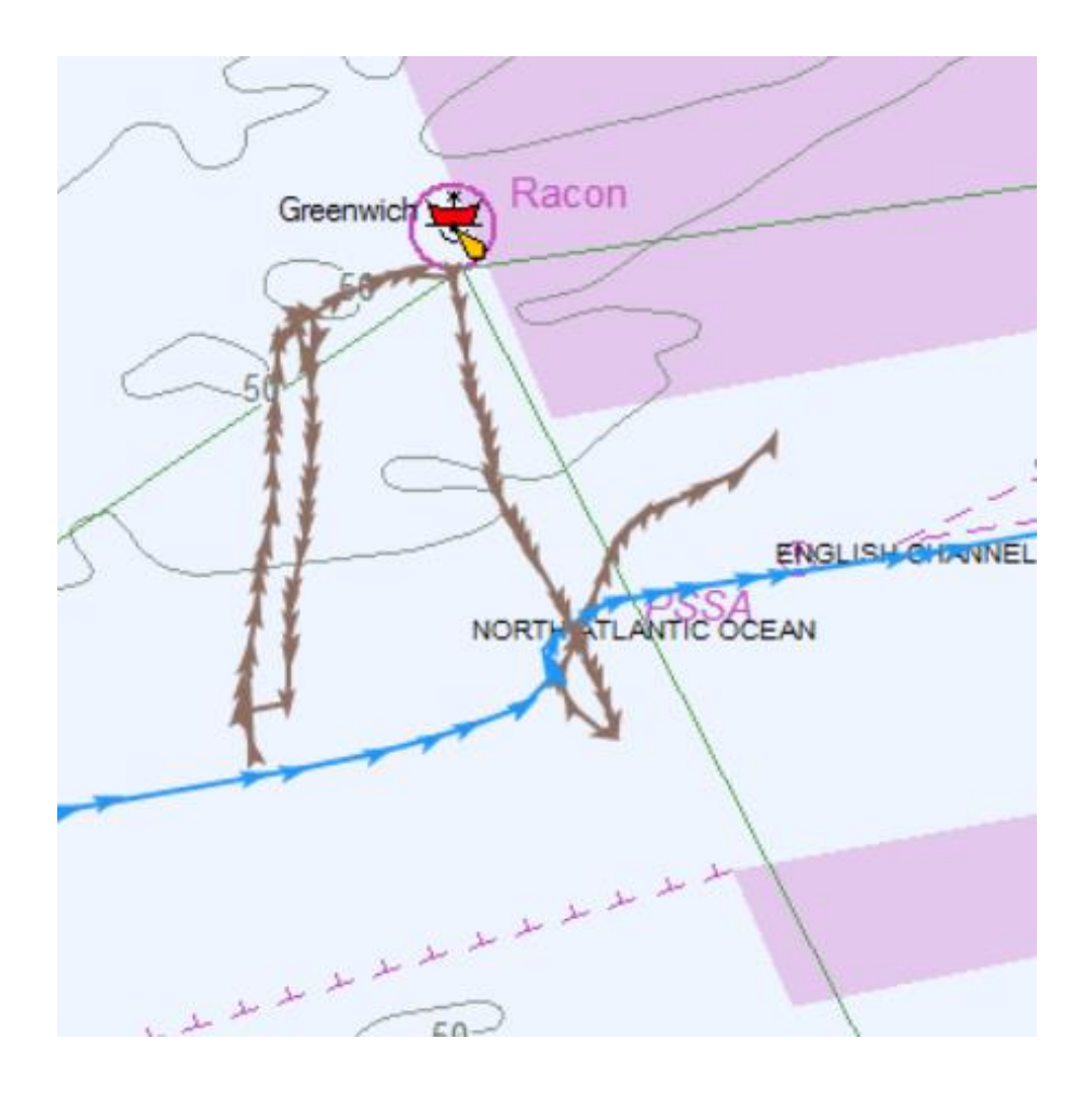
Figure 1 - Location of collision

The collision resulted in material damage only and both vessels were able to continue their voyage by their own means.