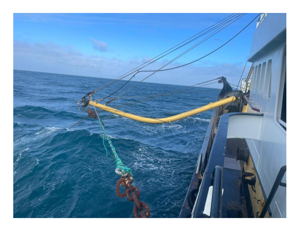
Figure 4 - Damage to PS derrick

The visible damage on board the FV O.231-DEN HOOPE was mainly limited to the derrick, as shown in Figure 4. No damage was found on board the MT SEASONG.