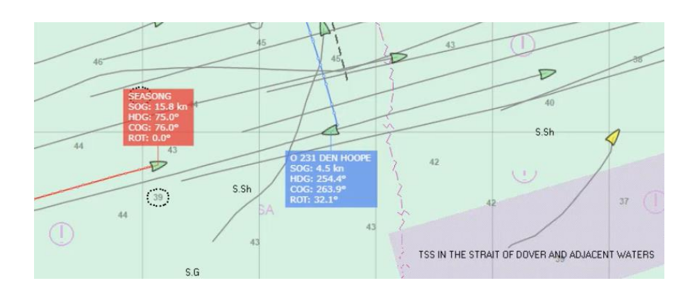
Figure 2 - Positions at about 09:56 am

On the radar on board the MT SEASONG the target of the FV O.231-DEN HOOPE was shown in red indicating a danger of collision, as the CPA was 0,08 nm. The distance between both vessels was about 3 nm at that time.